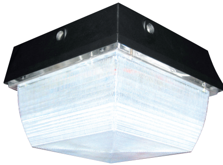
Item No.: LC-H505-40W